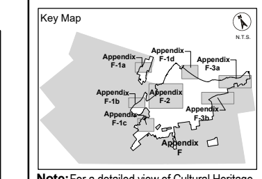
Note: For a detailed view of Cultural Heritage Resources, refer to Appendices F-1, F-2 & F-3.