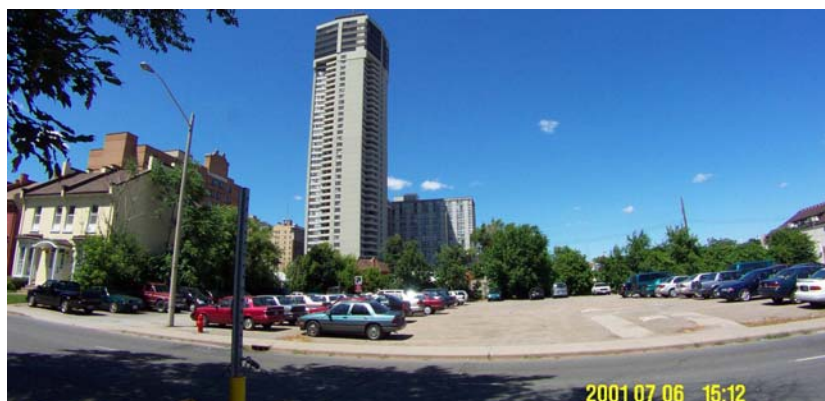
135 Hunter Street East, Hamilton – Pre-redevelopment

The purpose of Report PED06106 is to recommend a program of tax grants for 135 Hunter Street East. The redevelopment of said property represents the second completed and reassessed development submitted under the EZ Program. City Council approved 135 Hunter Street East (Hamilton) Ltd.’s construction of an office building improvement at 135 Hunter Street East, Hamilton as an eligible project in accordance with EZ Program terms on August 13, 2003. The redevelopment involved the construction of a new two-storey building on a former parking lot. The actual costs incurred in developing the property were $2,740,383.