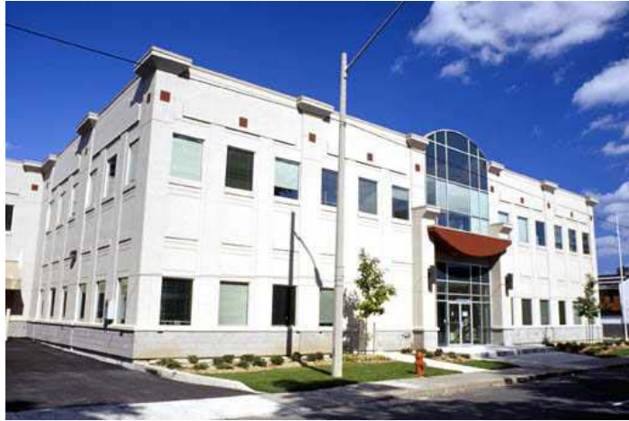
135 Hunter Street East, Hamilton – Post-redevelopment

Downtown Renewal staff, in co-operation with staff from Taxation and the City Solicitor’s office, have developed the “Letter of Understanding” (“LOU”) concerning the program of grant payments under the terms of the EZ Program. Appendix “B” to Report PED06106 is the LOU that specifically relates to the development at 135 Hunter Street East, Hamilton. The owner, 135 Hunter Street East (Hamilton) Limited, has signed the LOU thereby accepting the terms and conditions outlined therein. The following provides an overview of the grant calculation for 135 Hunter Street East, Hamilton as presented in Appendix “B” to Report PED06106.