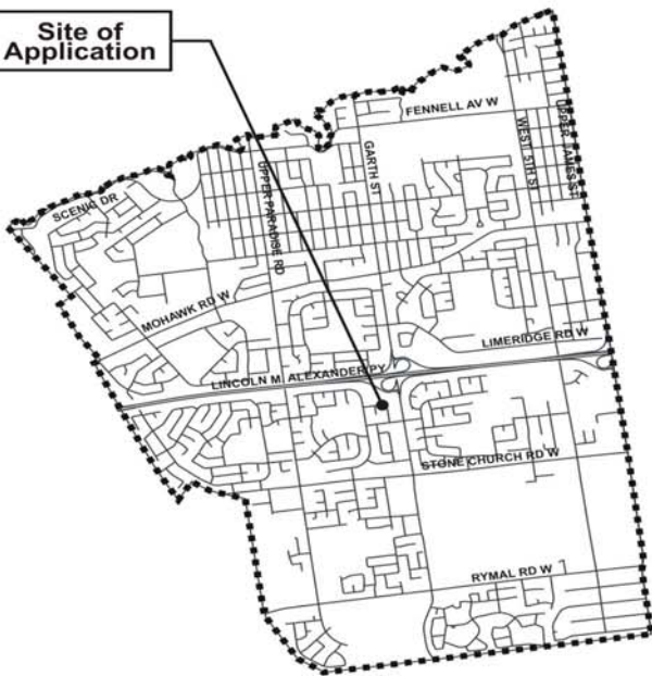
Ward 8 Keymap