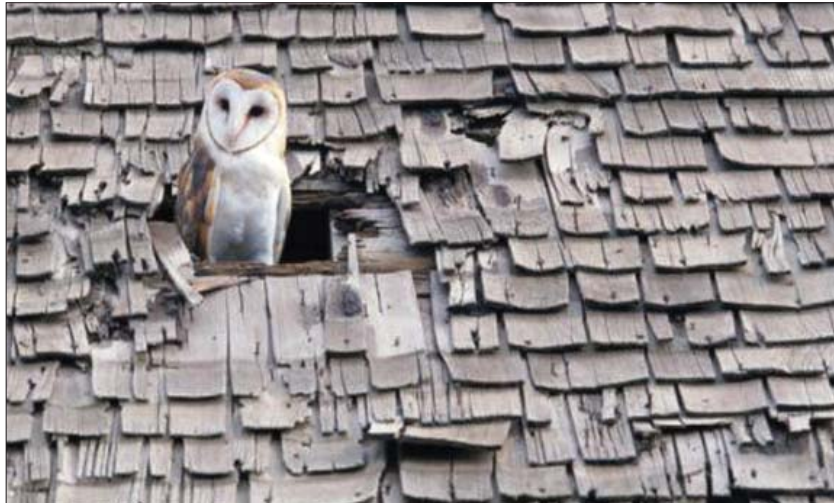
Example of Property Standards Violations

Exterior of buildings need to be maintained to prevent the entry of vermin and birds and prevent the leakage of water into the building.