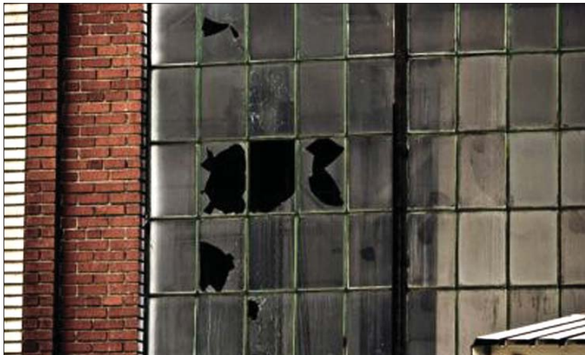
Example of Property Standards Violations

Damaged doors and windows eg. broken glass or hardware needs to be repaired or replaced.