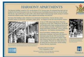
Heritage Recognition: 60 x 45 cm