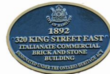
Designated Property: 30 x 22 cm

Commemorative Plaques mark sites telling larger stories (approx. 250 words) of historical/cultural events, and of persons and places associated with specific locations.