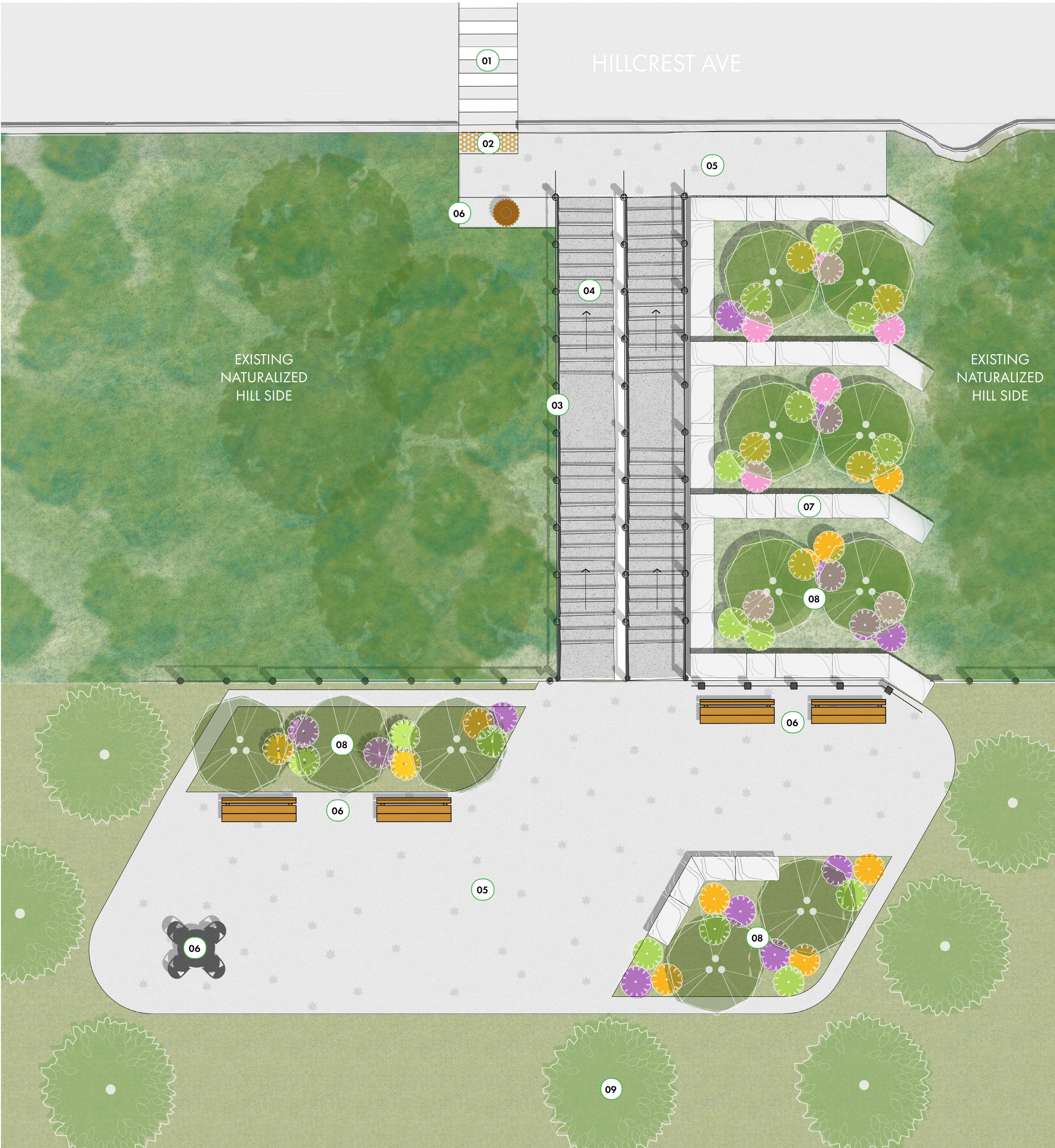
ARTIST RENDERING. ACTUAL DESIGN MAY DIFFER.