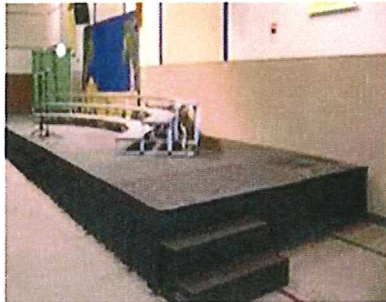
Dimension: 30m 2 (10m x 3m)