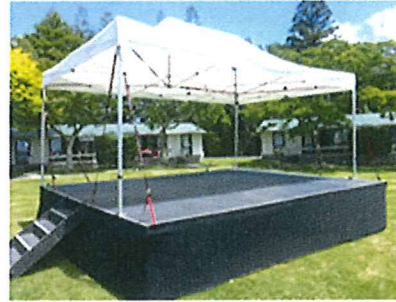
Dimension: 36m 2 (6mx6m)