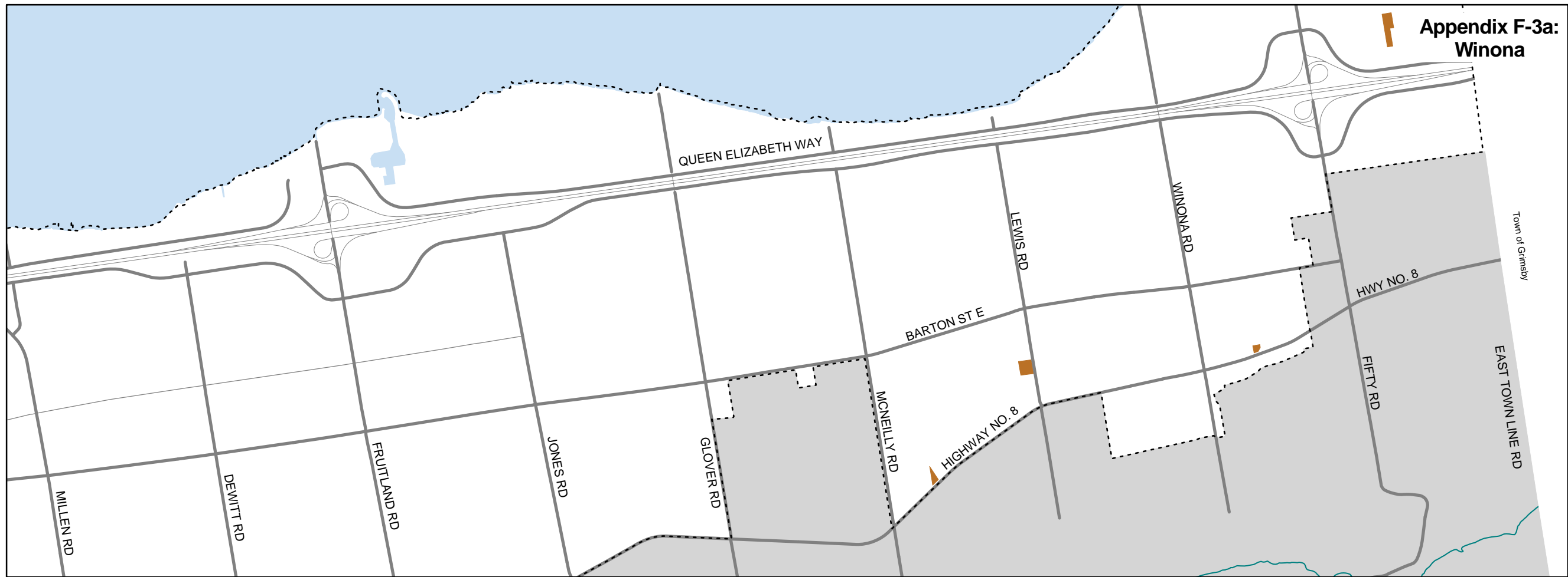
Appendix F-3a: Winona