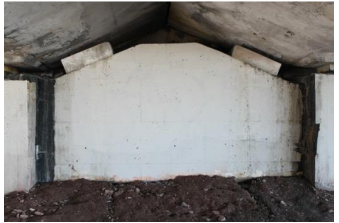
Figure 3: Columns