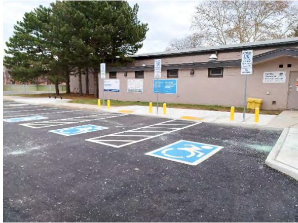
Parking Lot Resurfacing