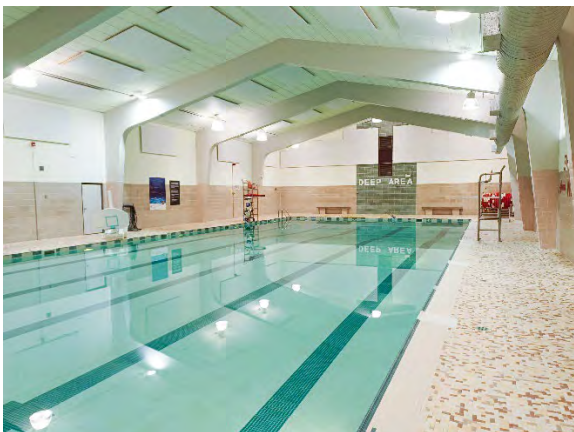
Pool Beam Repainting and Deep Clean