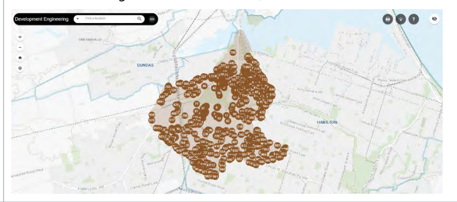
Figure shows current development and redevelopment applications (e.g., site plan, subdivision, zoning, and OP amendments).