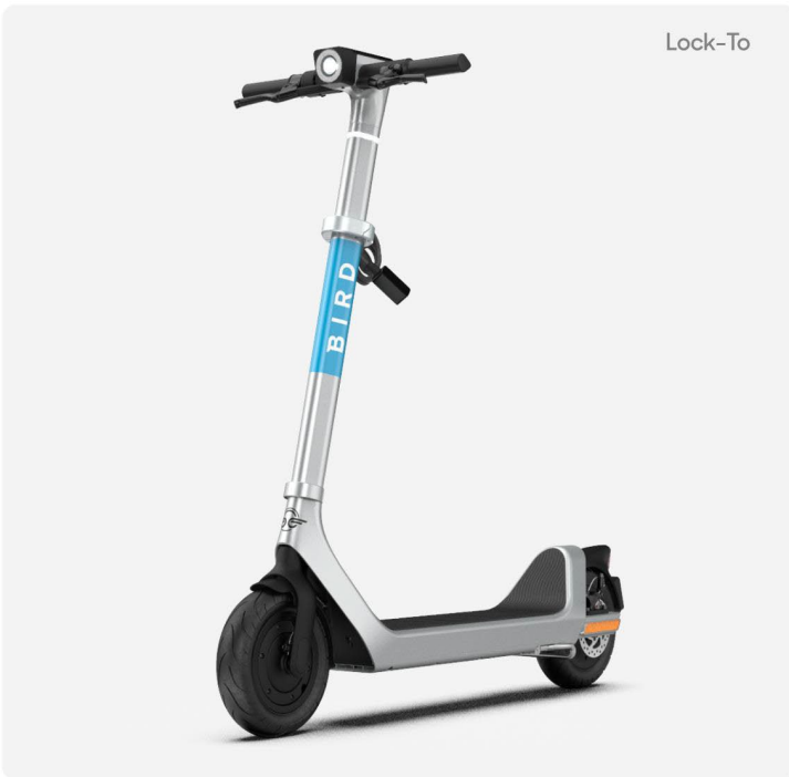
Photo of Bird Canada Version 3 E-Scooter, including "lock-to" mechanism