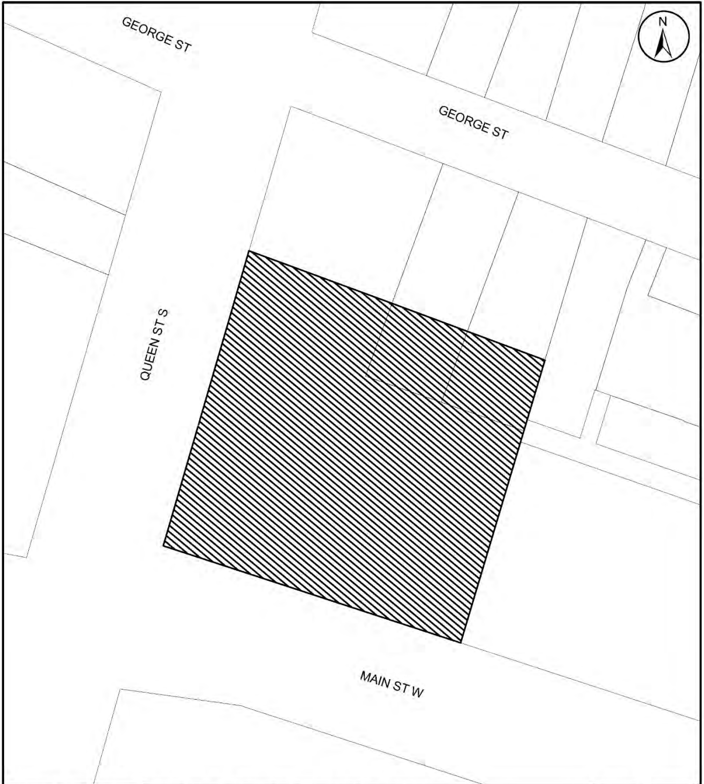
Figure 3 Schedule B: 220 and 222 Main Street West, 115 and 117 George Street and the south portion of 107 and 109 George Street