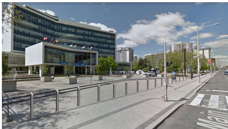
Figure 1: Approved design renderings of security bollards in front of Hamilton City Hall

Each phase will take between three to four weeks to complete and includes the installation of temporary construction fencing, rebar installations, concrete pouring, the installation of bollards and clean-up activities.