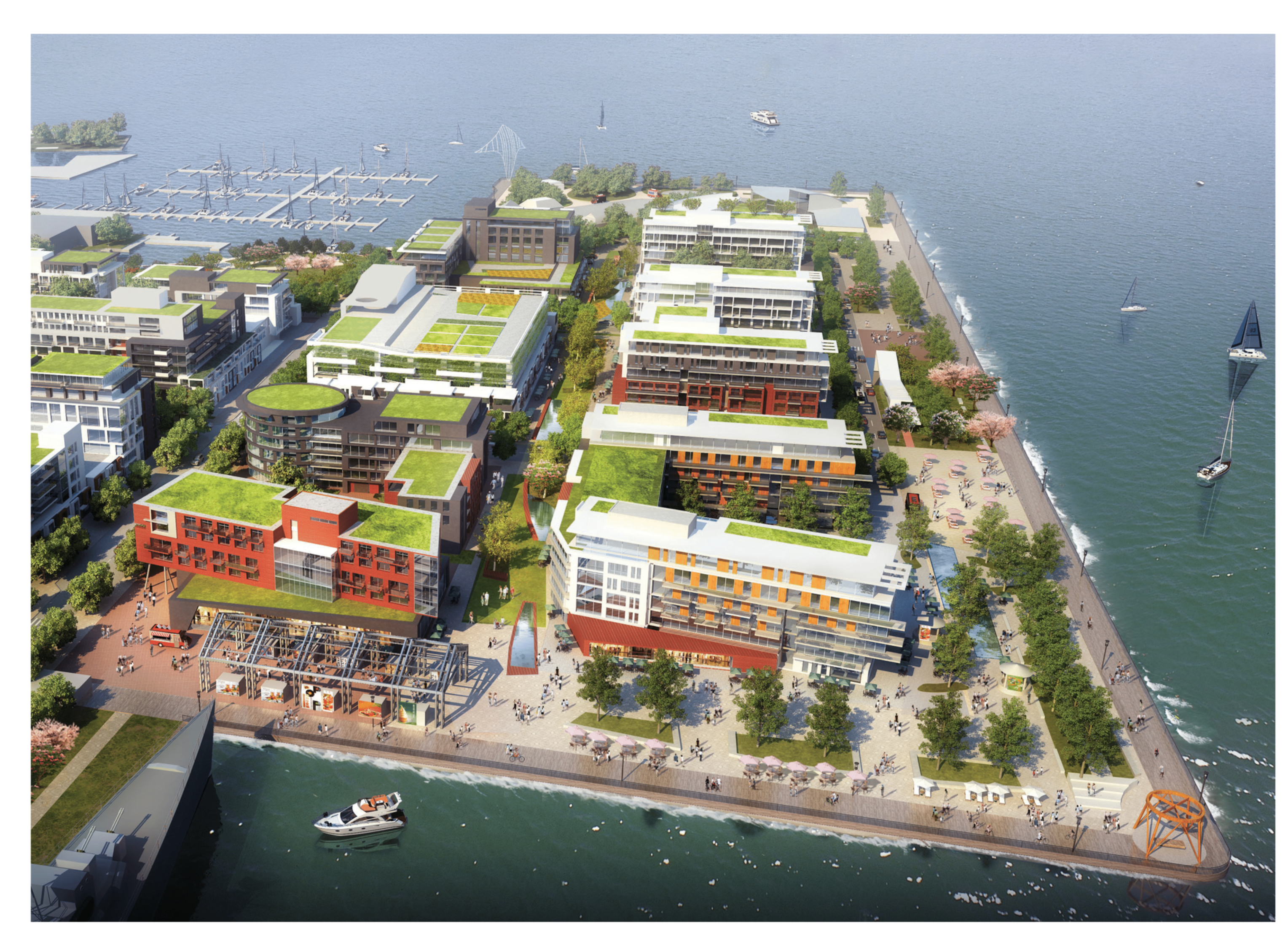
Rendering from the Pier 8 Urban Design Guideline 2016, by Brook McIlroy