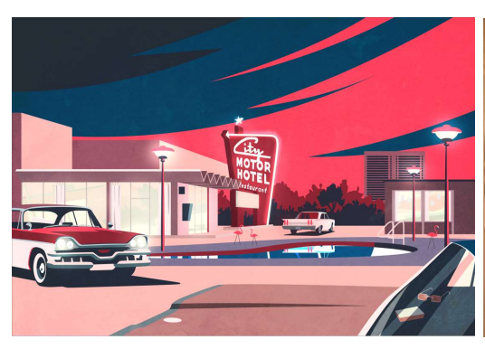
Figure 6 – First draft image and rendering of the City Motor Hotel mural

The first is the City Motor Hotel-themed graphic art proposed to be installed across from the elevators at ground level. Douglas Peterson-Hui of The Architects Garage has been given the commission to generate this art. This is part of a collection of three murals relating to the site and area that will feature in the common areas. The initial draft of the image, as well as a rendering of the image installed in situ (in the building's lobby) is provided in Figure 6.