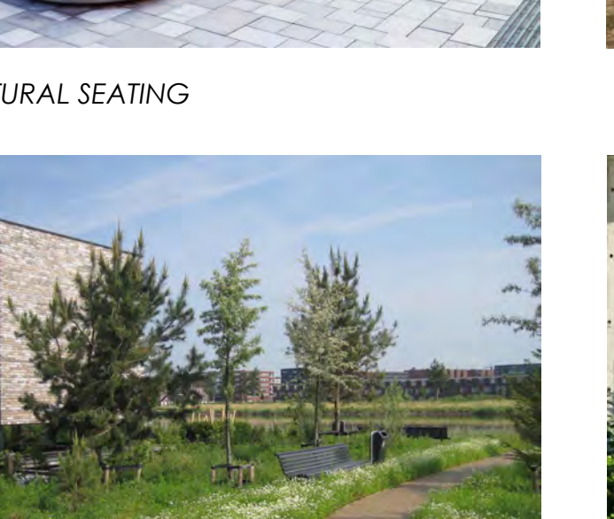
NATURALIZED TRAIL WITH SEATING