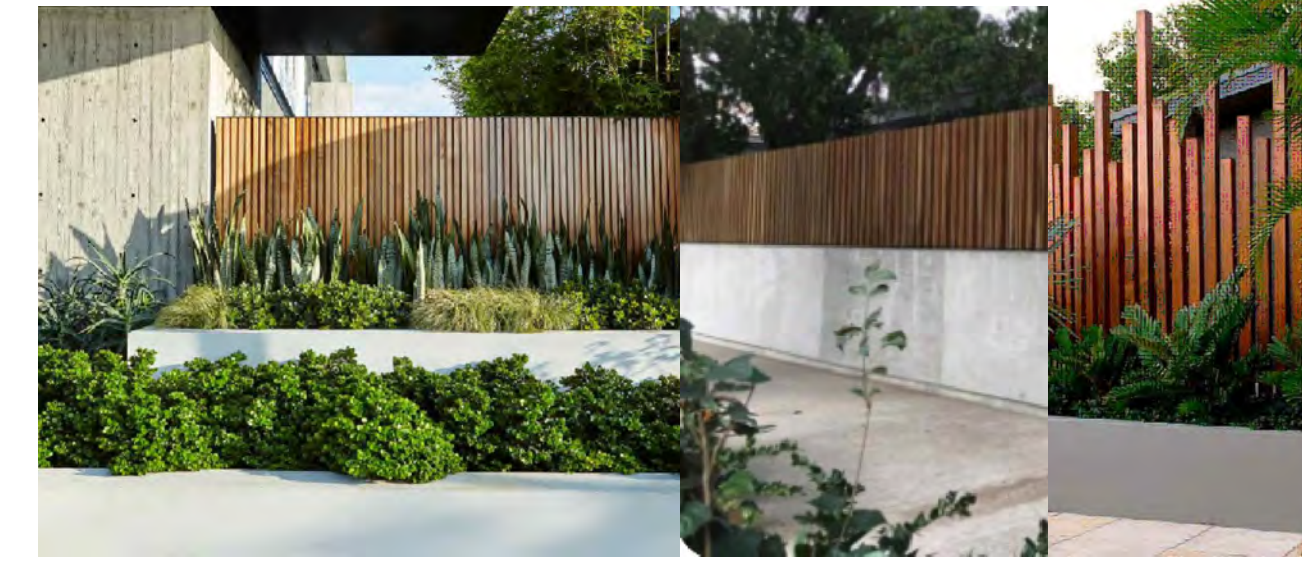
FEATURE CURVED WALL WITH SCREEN, ORNAMENTAL GRASSES AND TREES