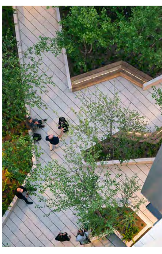
ANGULAR PATHWAYS TO MIMIC BUILDING FORM