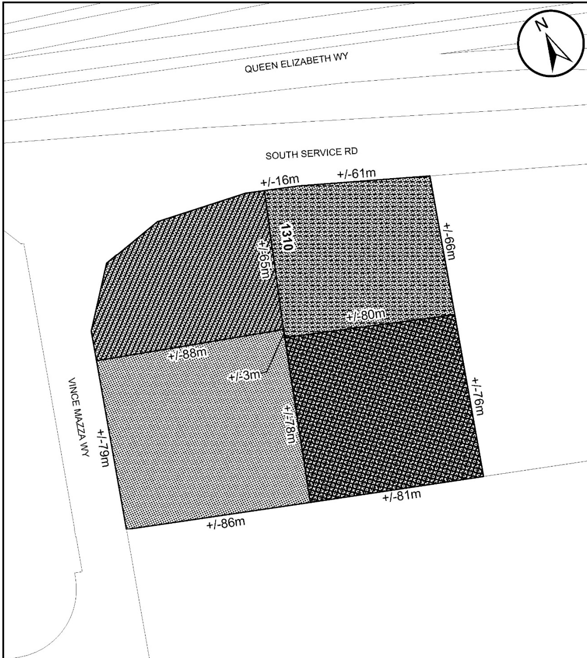
Special Figure 35: Maximum Building Heights for 1310 South Service Road