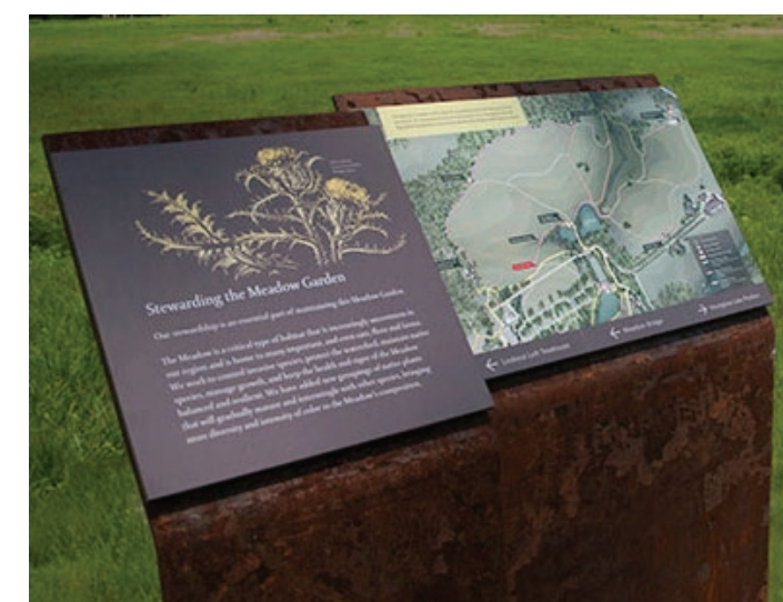
8 Interpretive Signage