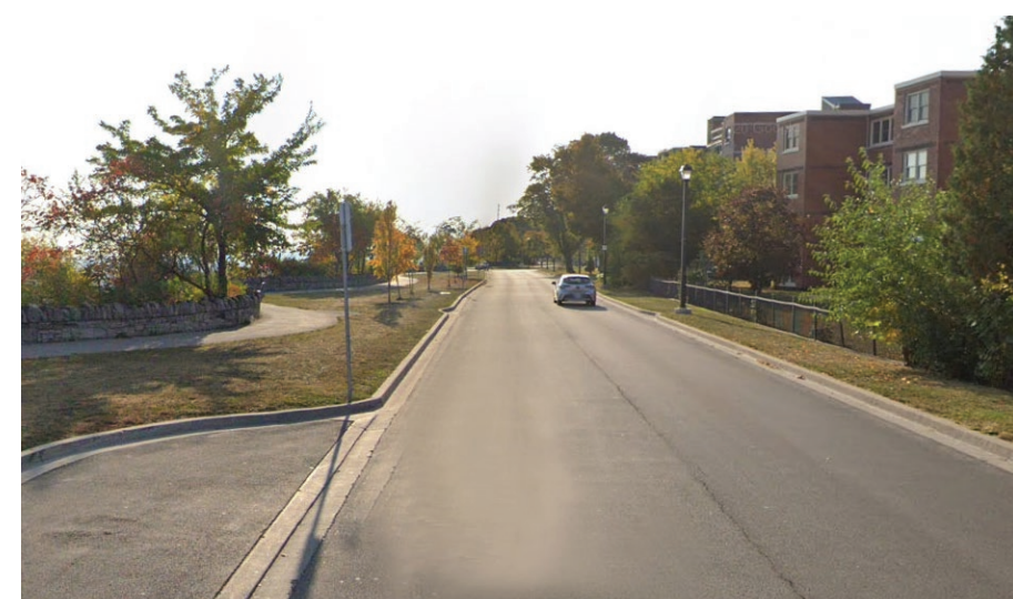
2 One Way Vehicular Route