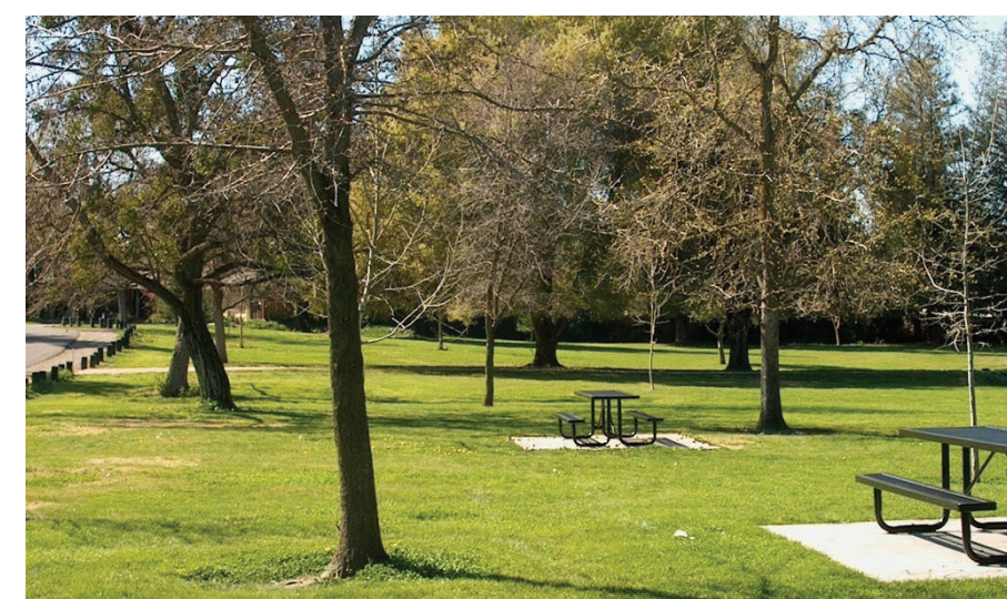
9 Open Lawn