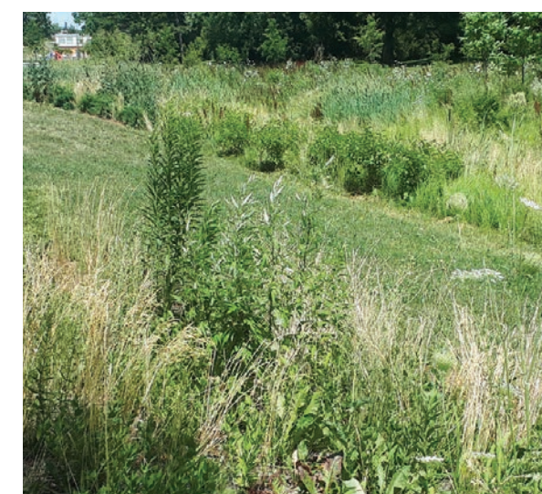
7 Native Planting