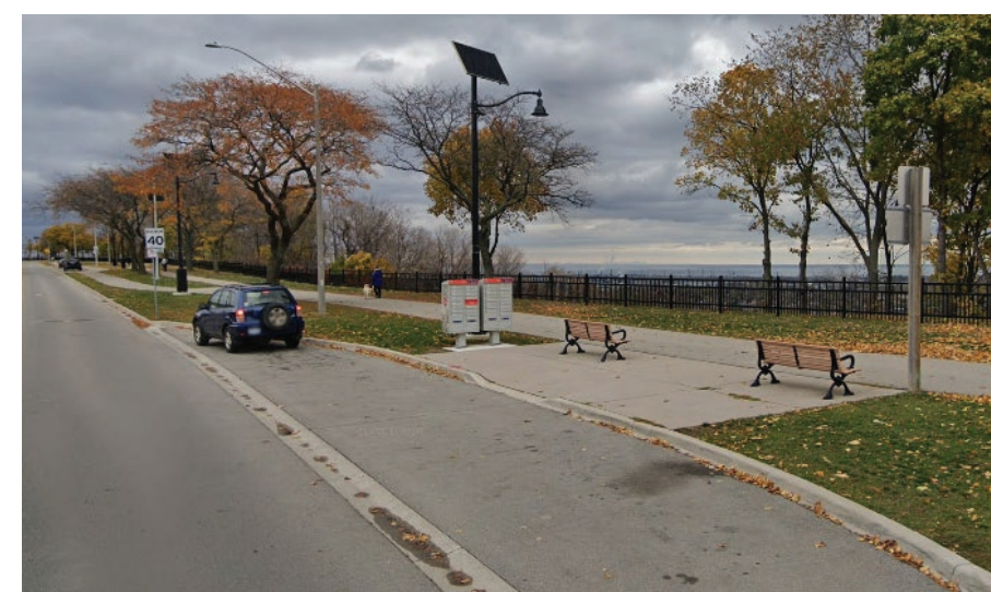
3 Lay-by Parking