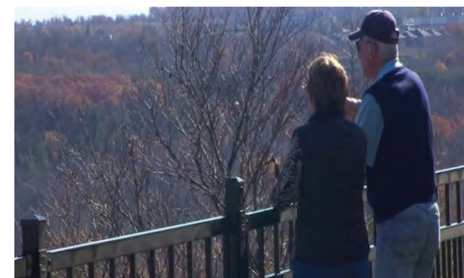
5 Viewing Area