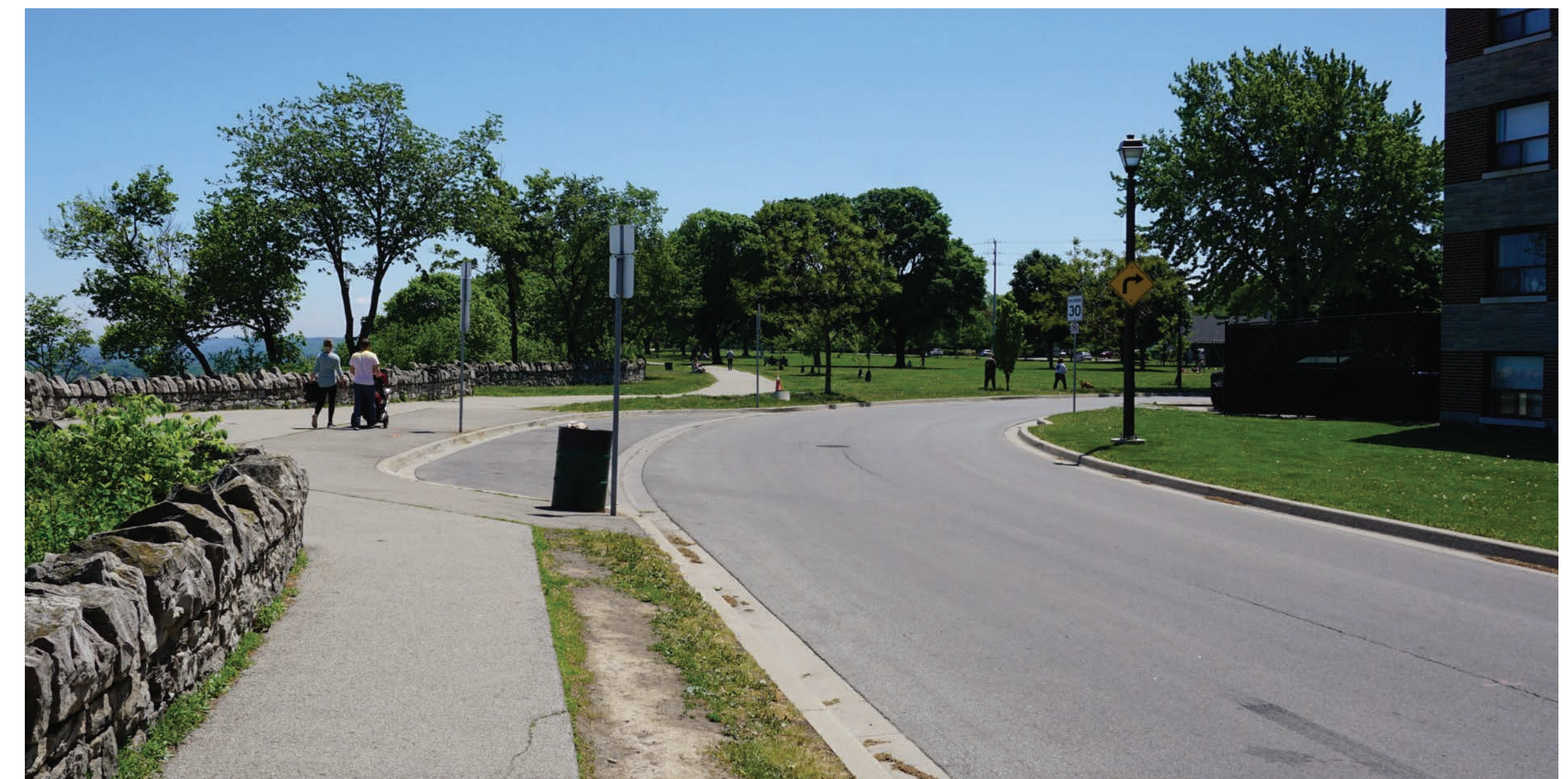
Existing Streetscape Conditions