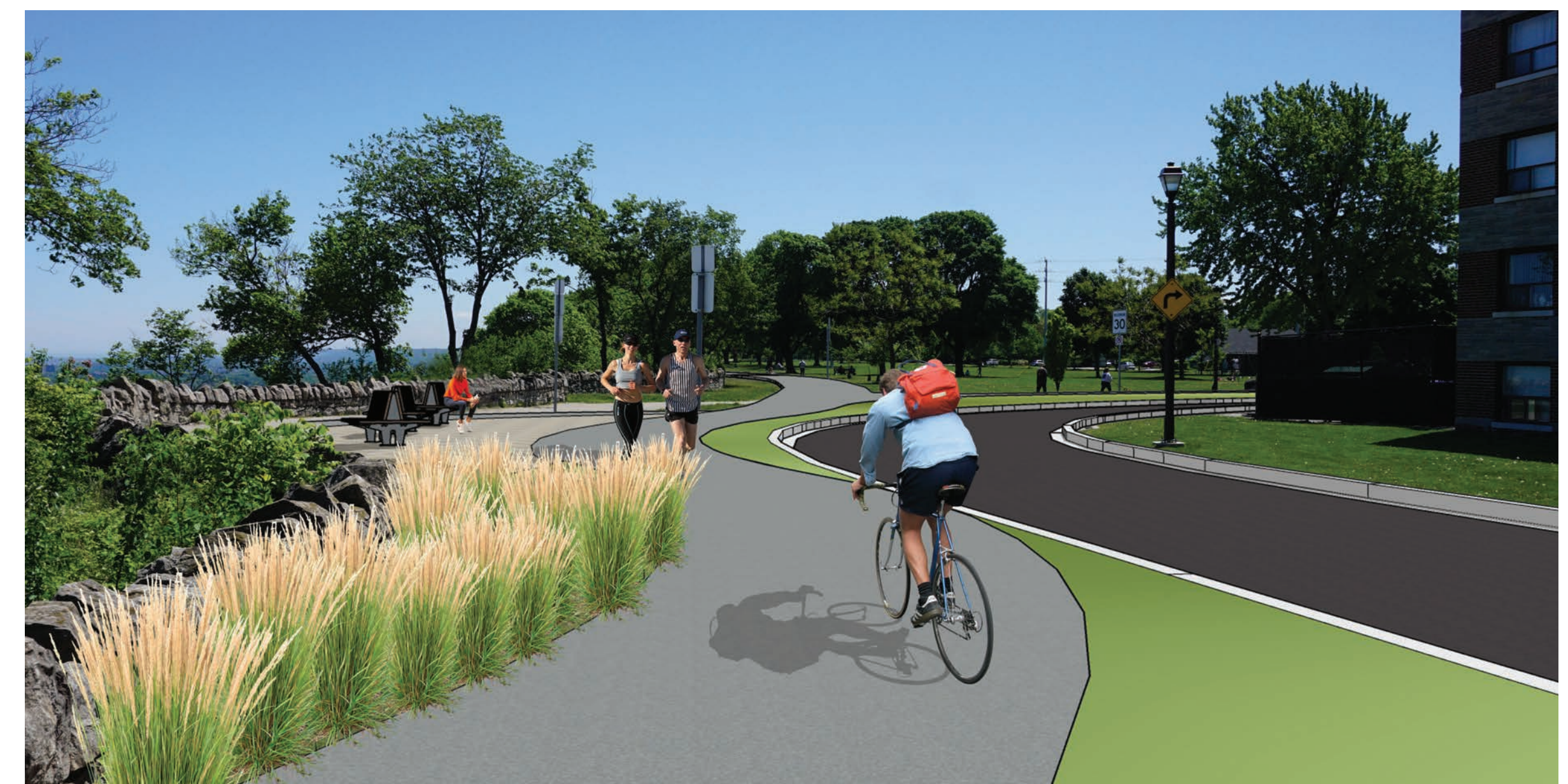
Streetscape Concept A - Perspective