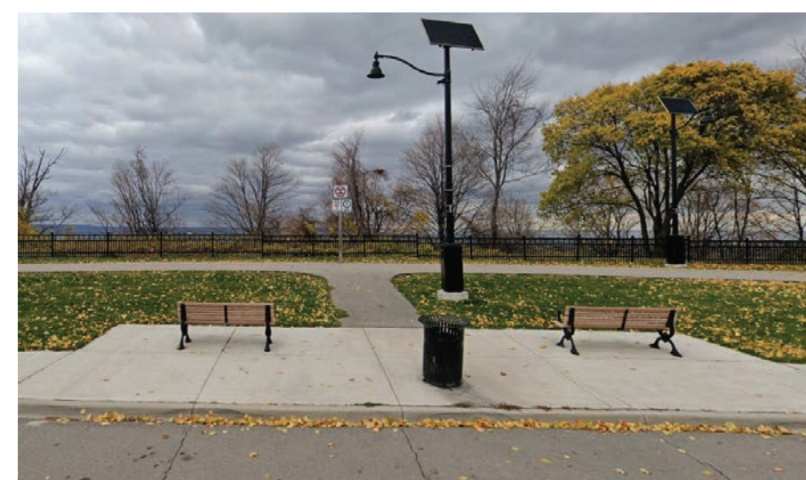
4 Furnishing Zone