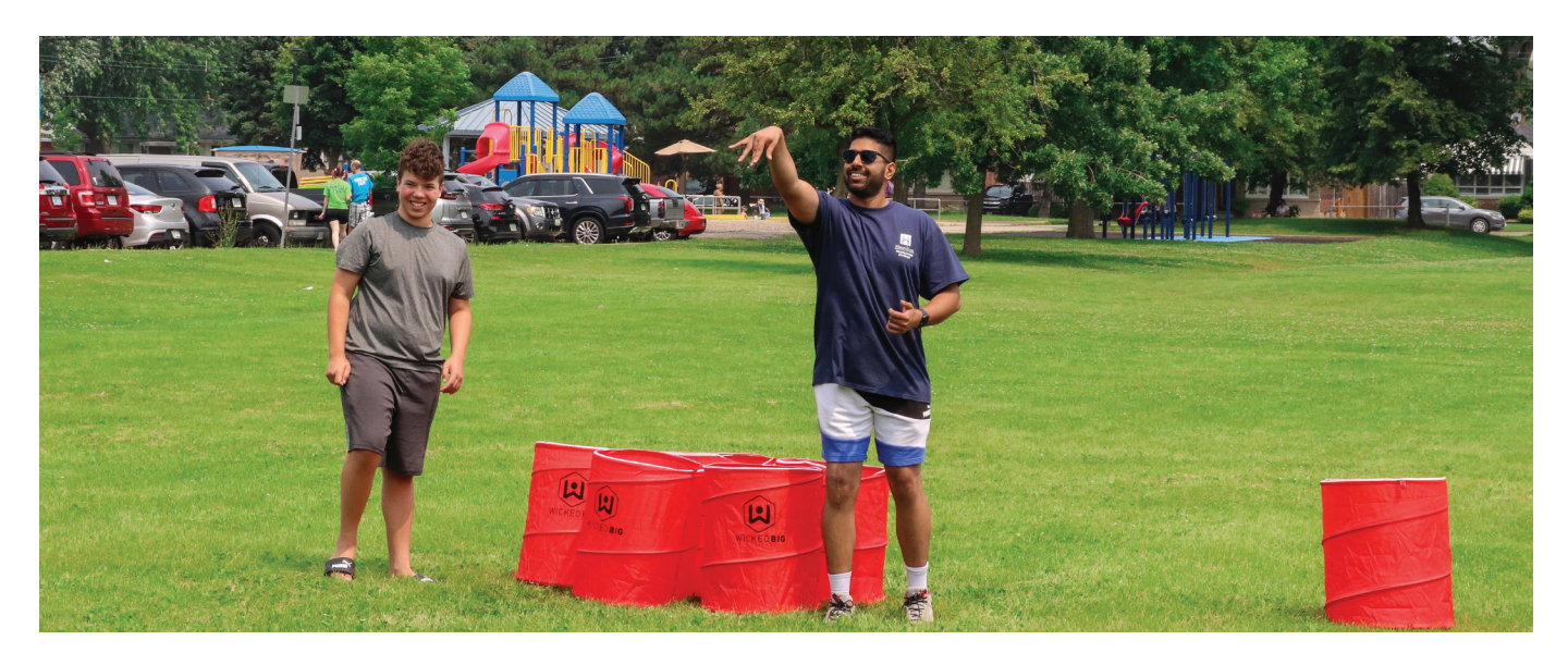
*4 day camp week due to Canada Day and Civic Holiday

*A week of exciting youth events, job readiness training and workshops, youth employment information and more. Schedule of events and locations coming soon, check hamilton.ca/youthrec for more information.