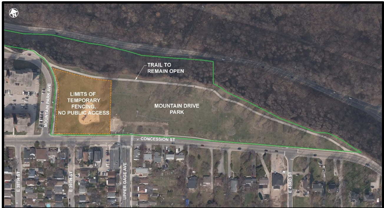
Figure 1 – Limits of Temporary Fencing, No Public Access