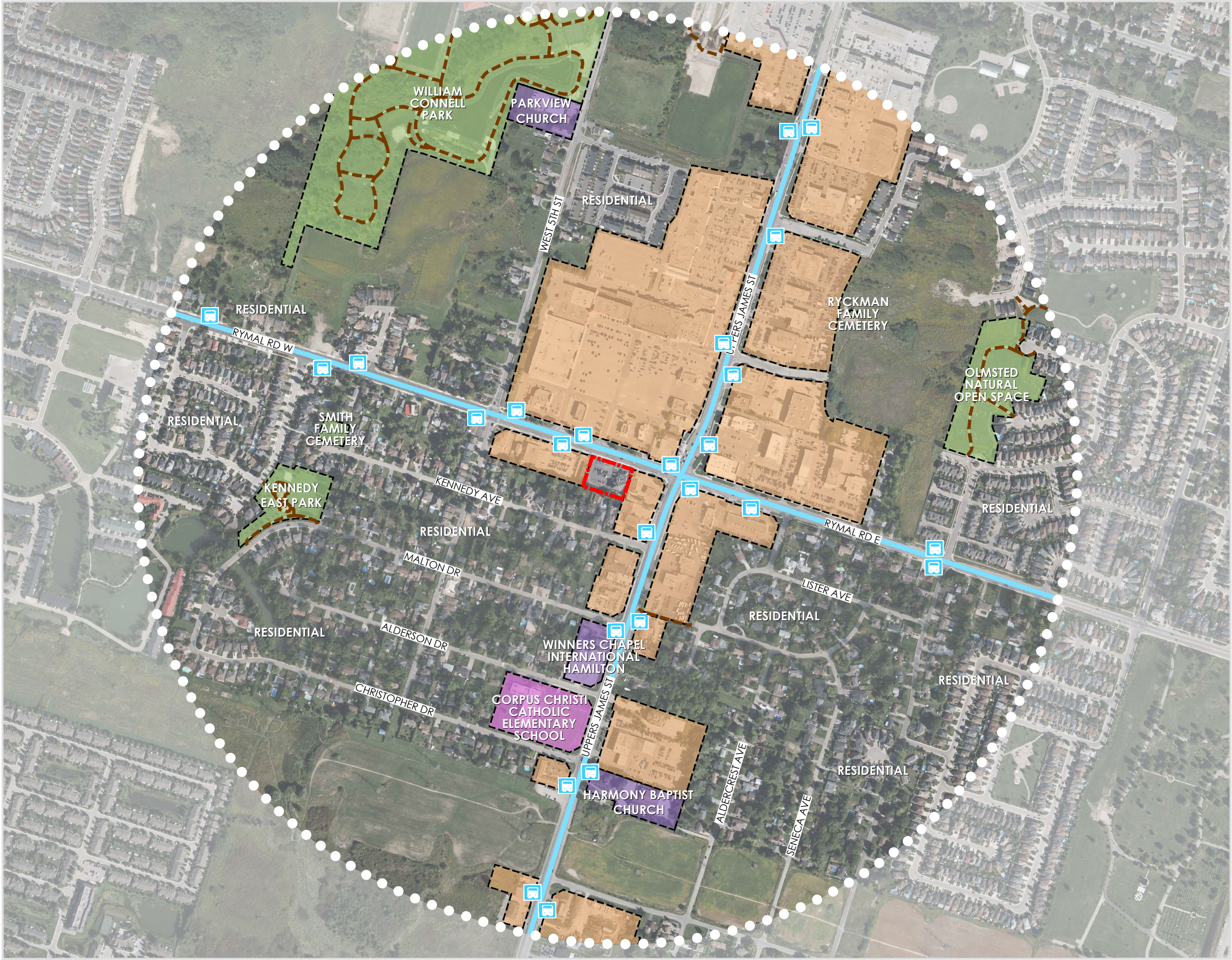
Figure 2: Context Plan