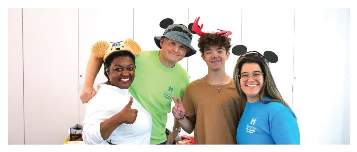
*4 day camp week due to Canada Day and Civic Holiday

*A week of exciting youth events, job readiness training and workshops, youth employment information and more. Schedule of events and locations coming soon, check hamilton.ca/youthrec for more information.