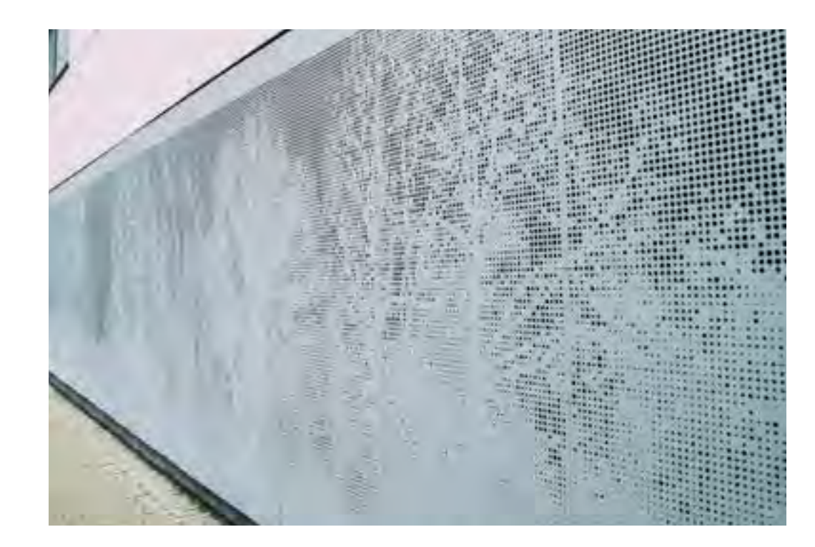
O6 SHADE STRUCTURE