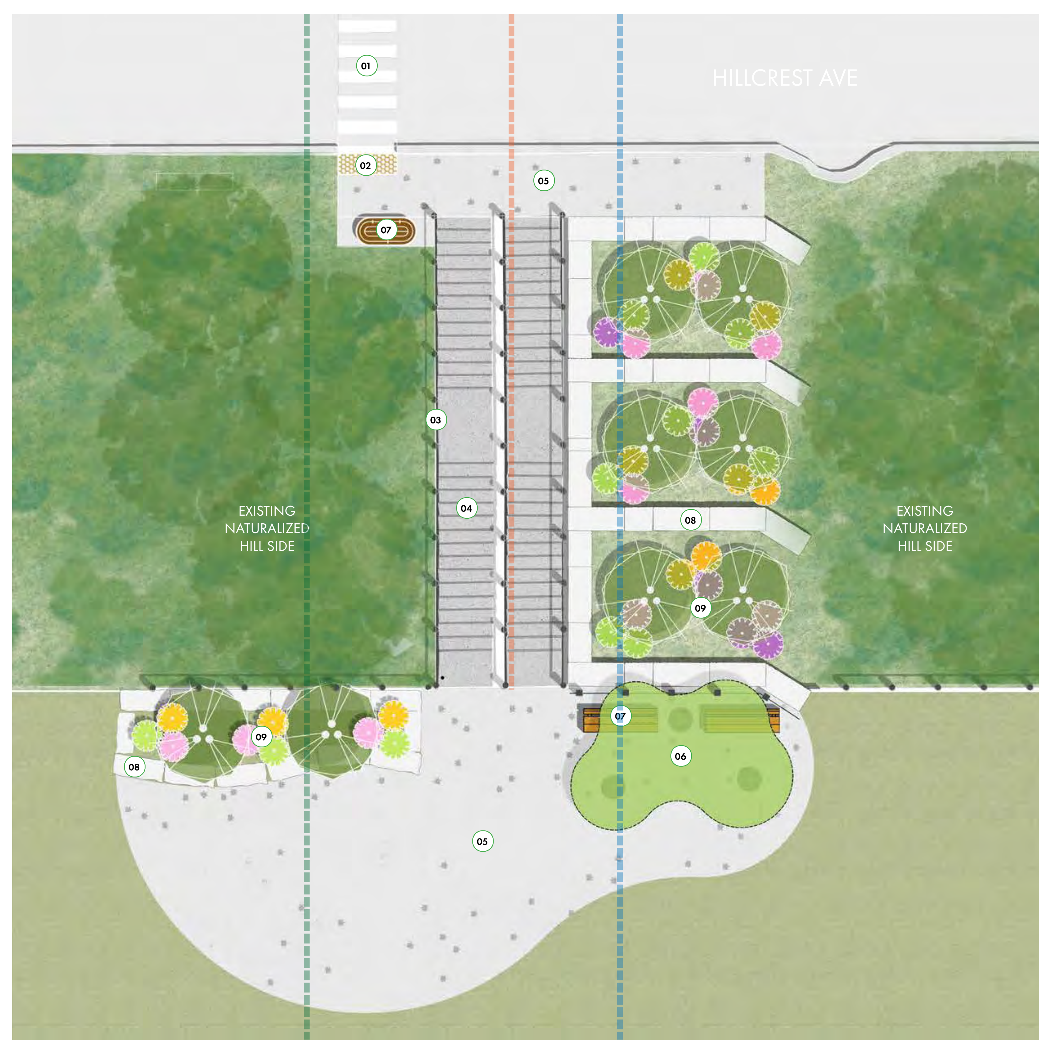
Artist rendering. Actual design may differ