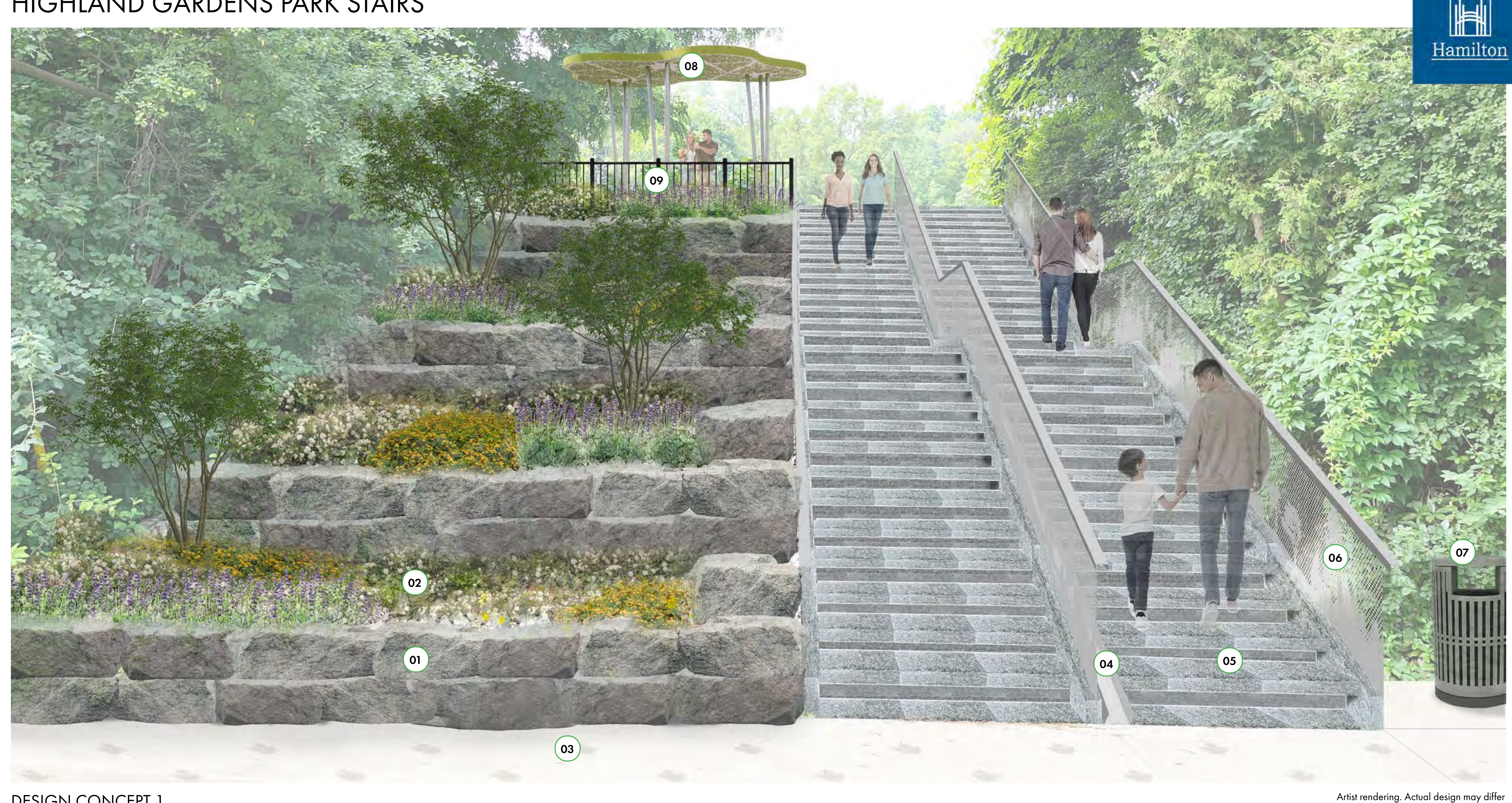
DESIGN CONCEPT 1