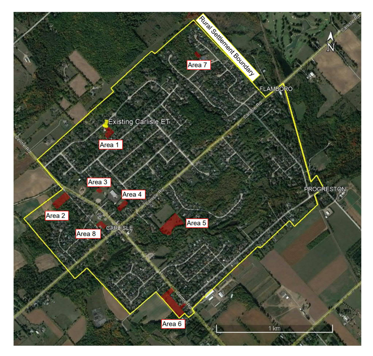
Figure 2-1 - Long List of Alternatives

An aerial view of the locations is shown in Figure 2-1 below.