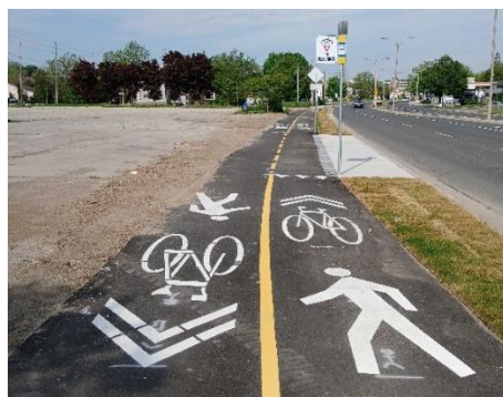
Cootes Drive, Ward 13 Multi-Use Path

As part of this project, the City of Hamilton is currently conducting community consultation to gather your feedback, which will help inform the design.