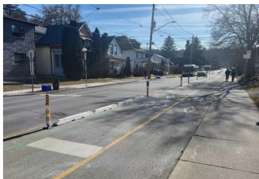
Emerson Street, Ward 1 Two-Way Cycle Track

Below you will find precedent images of similar existing cycling infrastructure within the City of Hamilton.