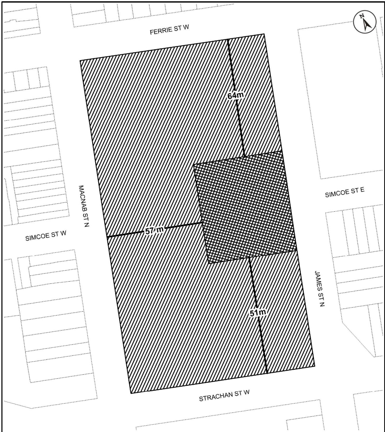
Special Figure 29: 405 James Street North