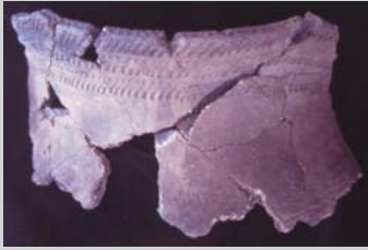
Reconstructed Native Pottery Vessel Kings Forest Park Site