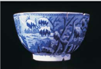
Historic Ceramic Vessel Pickard Site