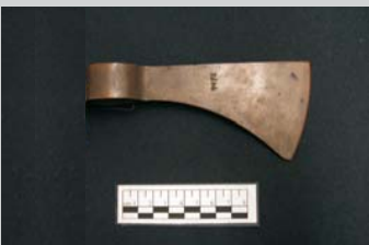
Copper Trade Axe Head McMaster University Wood Collection