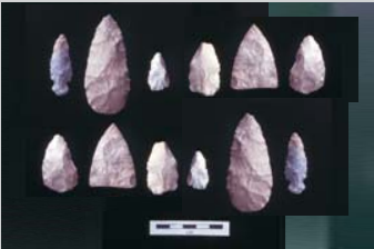
Nettling Projectile Points Spera 2 Site