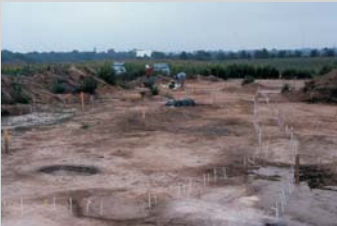
Iroquois Longhouse Settlement Pattern Serena Site