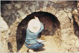
Lime Kiln Excavation Marshall Site