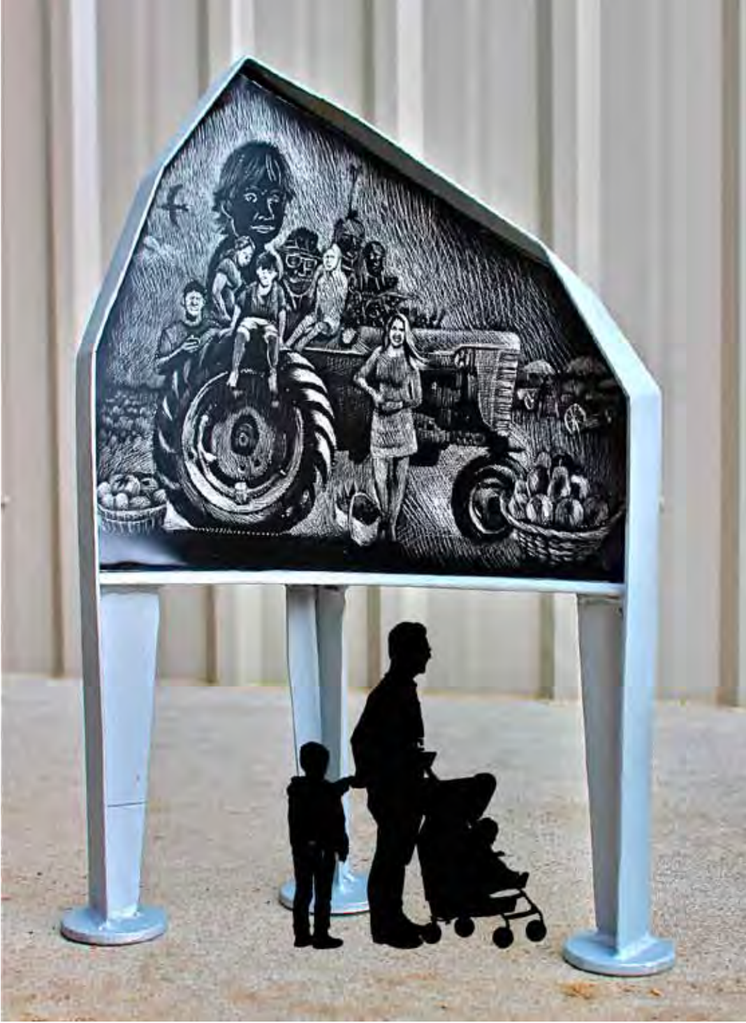
View from Market