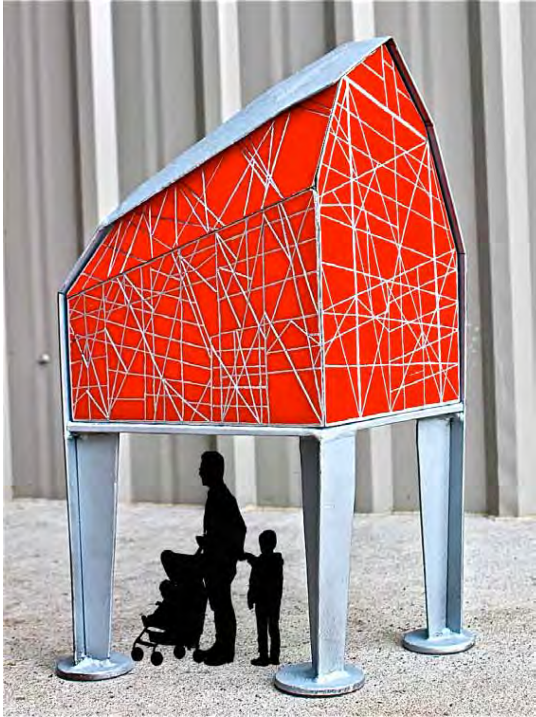
View from York Boulevard