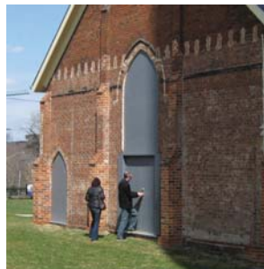
9. Rear exit door 10. Alternate exit door