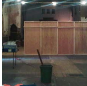
14. Main space features wide wood plank flooring and cast metal grates