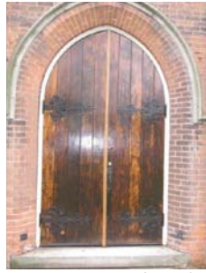
1. Main Entrance to be made accessible

This panel demonstrates the current conditions of the interior and points to some of the major issues that would need to be addressed if St. Mark's were to be restored.