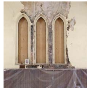
8. Missing stained glass windows