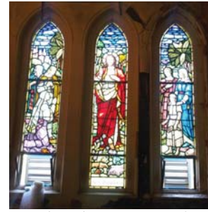
2. Early 20th century stained glass windows