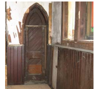
6. Alternate exit leading to alley way