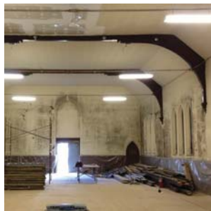
13. Temporary lighting