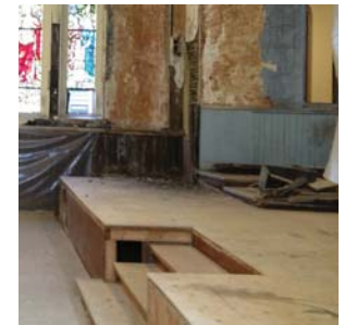
5. Elevated stage area