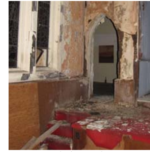
3. Damaged plaster due to damaged roof and soffits