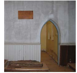
4. Room within bell tower - damaged framing in bell tower