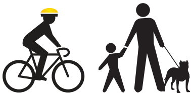
Watch for children & pets