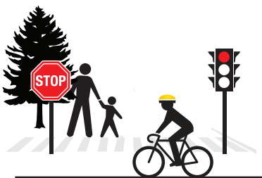
Obey signs and signals