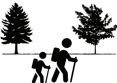
Keep to the right