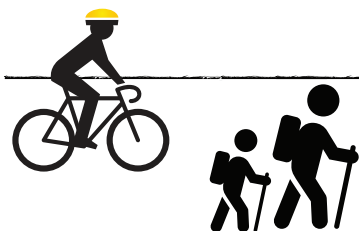
Pass on the left