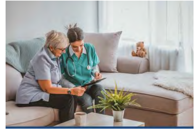
Ontario Health Teams: Guidance for Health Care Providers and Organizations