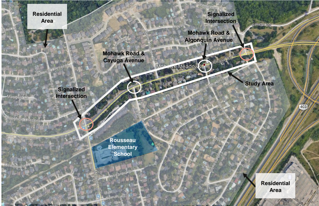
Figure 2: Land Use Surrounding Study Area